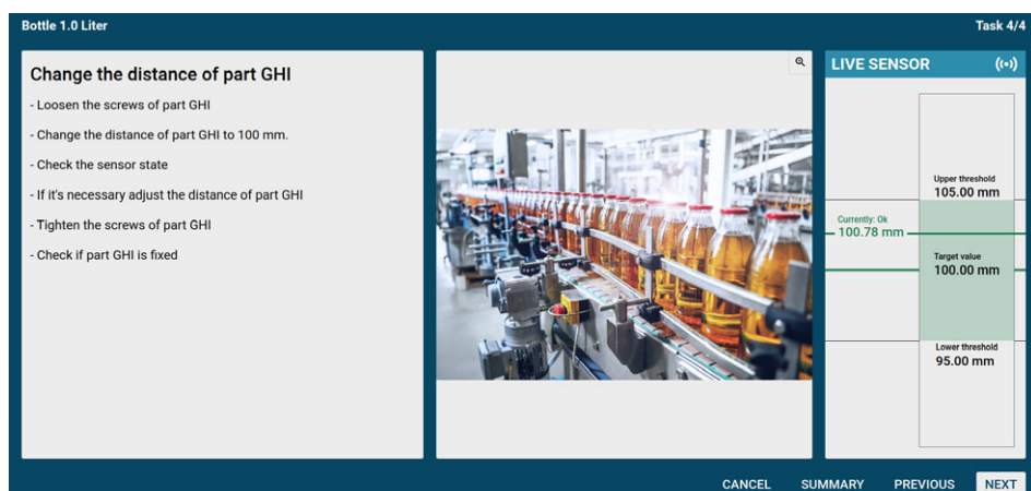
Figure 1 The Guided Changeover Solution operator guidance gives detailed instructions for each step during the changeover process. The sensor feedback makes it very easy to set the distance correctly within the tolerances.

Thanks to the Balluff solution, the bottleneck in the format change process located in the labeler was successfully removed, resulting in a significant decrease in format change downtime from 80 minutes to just 40 minutes . As a result, the customer plans to implement the "Guided Changeover Solution" on additional machines to fully optimize the production line.